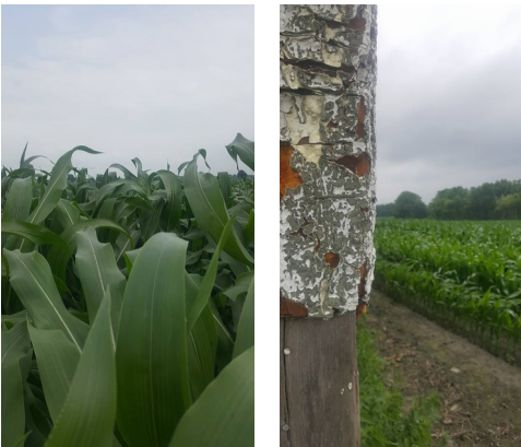
Wayne County Agricultural Security Areas